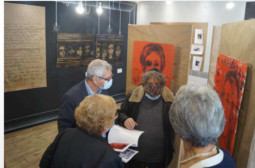
25th October, 2020: Testimonies, art and music to keep the memory alive